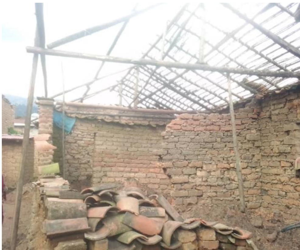
Figure 4 House of the child of Jyambere J Jeanette Uwajeneza after rainfall of May 2023

“Dear Sponsors, For the following information captured in our region, the flood destroyed one house of our Participant of Project named UWAJENEZA Jeanette. In annexure of this message, we attached the caption of photo where the house was destroyed”