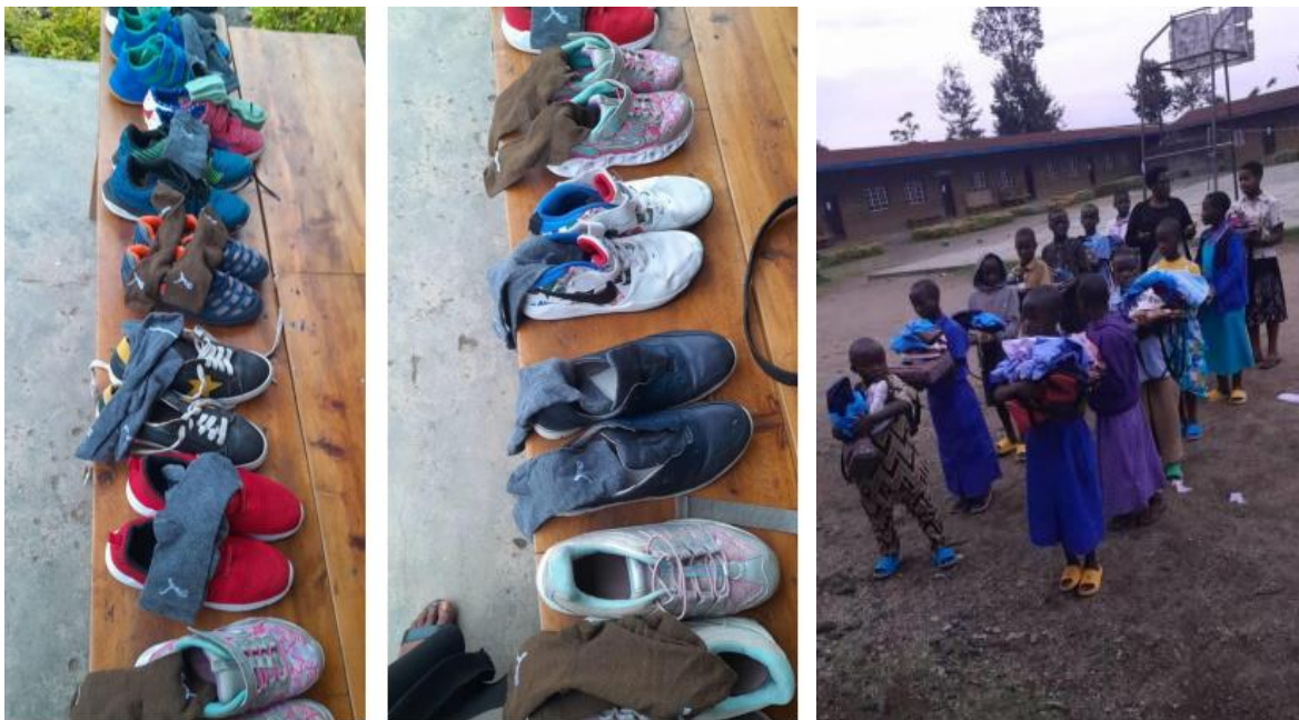
Figure 7 Receiving Sponsored Clothing

"According to the children supported by Jyambere Foundation for their Mission in the future, their mission are better for reason they received different scholastic materials such as notebooks, pens, shoes, school uniforms and other necessities but there is challenges when the children finished primary education level; many of them case to continue their studies in secondary level because Jyambere Foundation supposed that will stop to support them and they don't have good living standard in their families."