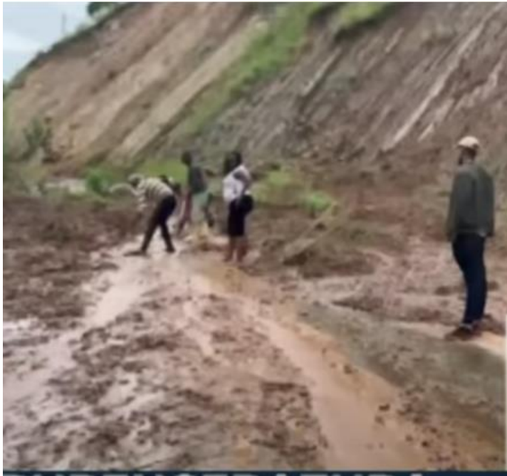
Figure 2 Road that was completely closed due to landslide in Ngororero

In May 2023, 23 people were killed by floods and landslides. Homes and property were destroyed, causing thousands of people to flee. Roads were completely closed and 4 schools were destroyed.