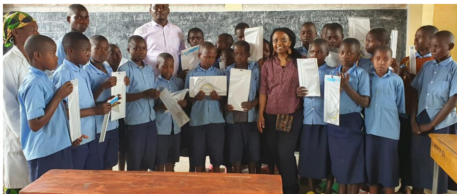
Figure 6 Children in a classroom with the secretary and supervisor at Kabaya

In April 2023, Jyambere's secretary visited the children and each child received a math kit.