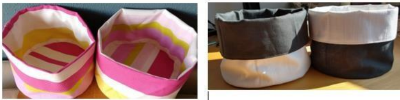
Figure 8 For sale bread baskets

Mrs. Sien makes bread baskets and sells them. The proceeds are intended for the Jyambere foundation.