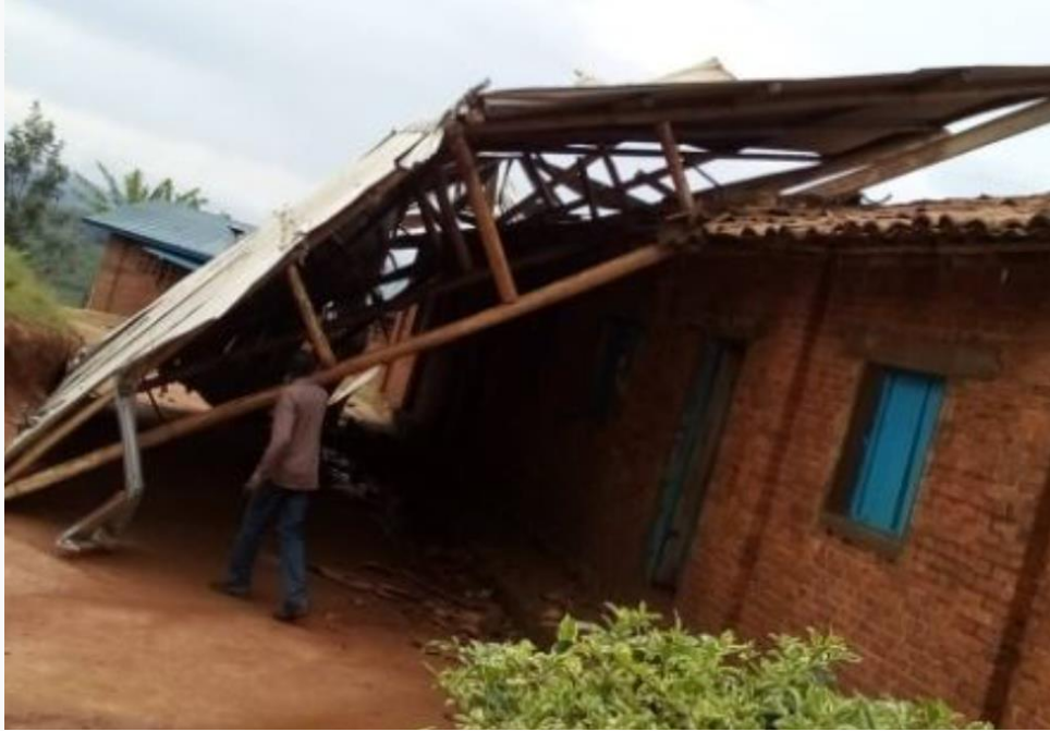
Figure 3 Gaseke school damaged by rainfall

The school buildings are not strong enough to withstand the impact of natural disasters. It is also one of the challenges posed by climate change, especially for vulnerable communities of Ngororero. Parents have to wait a long time for their children's rain-damaged schools to be repaired.