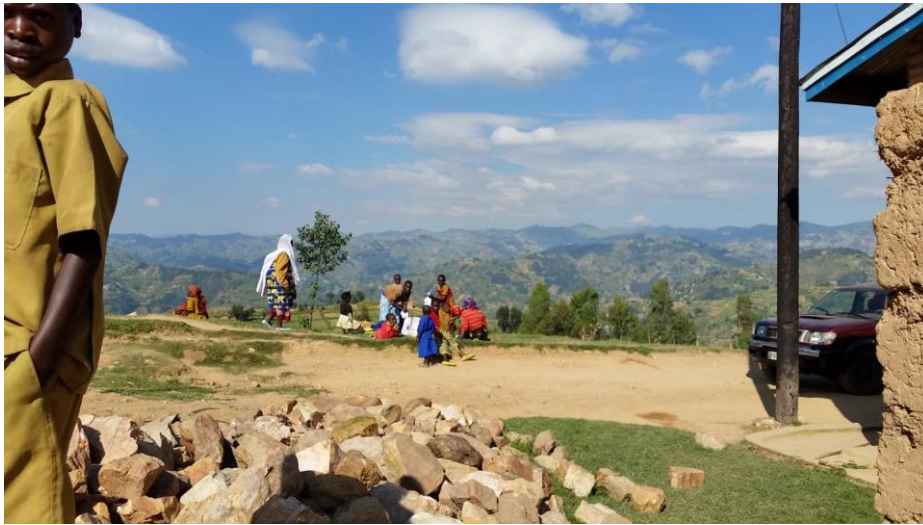
View of the hills in the North 7 km from the village of Kabaya